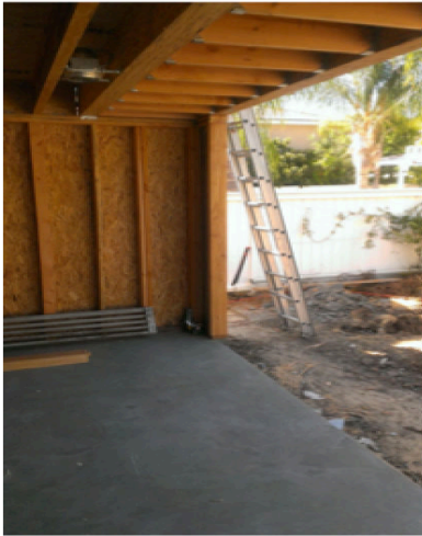
CLEAN OPENING WITH THE HEADER AND SIDES EXPOSED