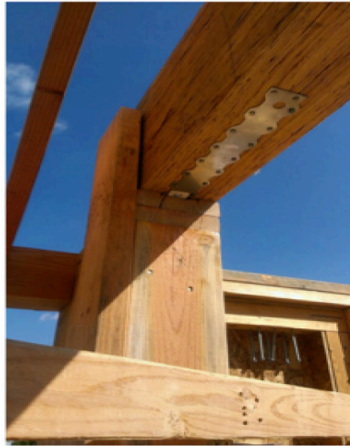
CLEAN CORNERS, NO PRETRUDING BOLTS OR ELECTRICAL