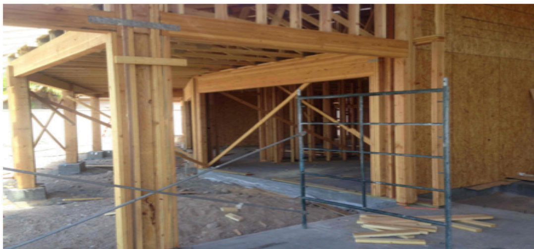
CLEAN ROUGH OPENING WITH HEADER AND SIDES EXPOSED